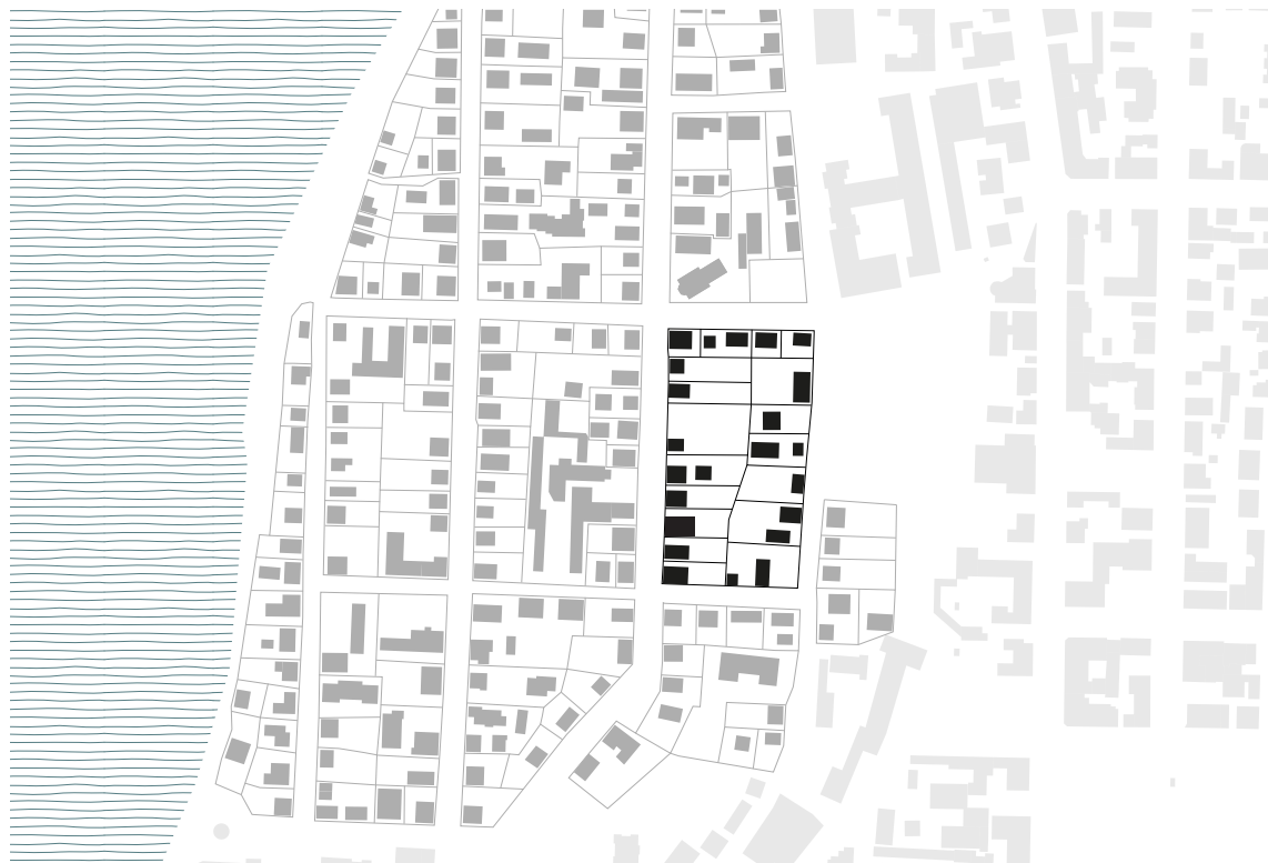
Block of Tatarskaya sloboda, by K. Gulyaeva, 2022

plots with houses without common yards located along the perimeter formed the block. In addition to the main residential building, the plots were outbuildings. One- and two-story residential houses were wooden, stone or mixed materials. The decor of the houses used traditional Tatar motifs.