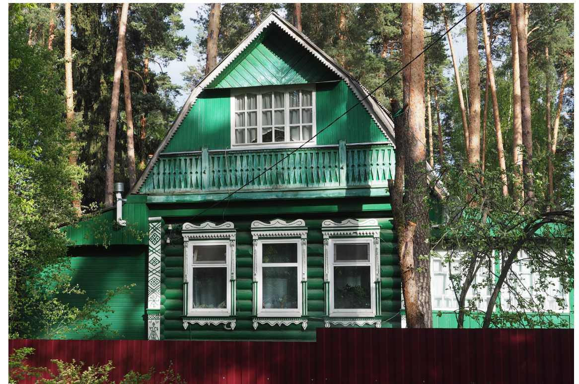
Single family residential house in Kratovo, by A. Svetlov, 2020