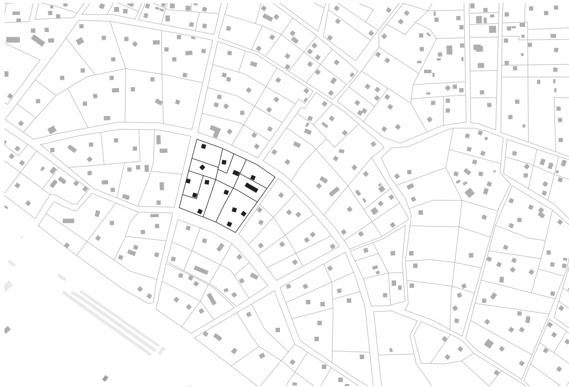
Block of Kratovo, by K. Gulyaeva, 2022

services and recreational areas. On a territory of more than 700 hectares, it was planned to build a well-maintained residential area consisting of detached low-rise buildings according to standard designs of several types with a plot of 12 acres under each of them. The project was partly realized.