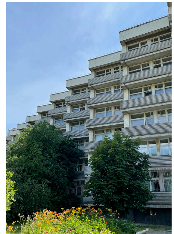
Brezhnevka housing