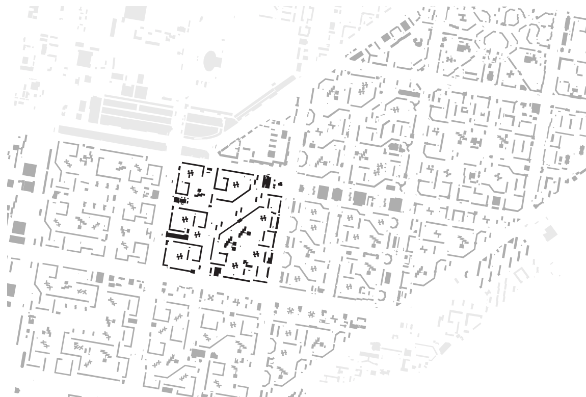
Block „Quarter №4“ of Avtozavodskiy district, by L. Klein, 2022