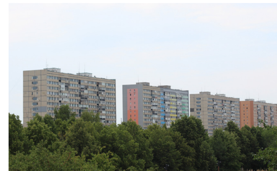
Brezhnevka housing