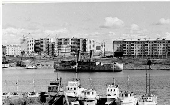
View of the microrayon from the dam, by E. Bruhonenko, 1979

bined the concept of creating a local residential and public zones. Today there is a significant transformation of the neighbourhood at the level of spatial and planning structure, with impact on changing the quality of the urban environment and the loss of morphological features of the original project.