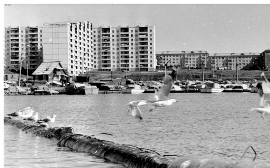
View of the microrayon from the South, by E. Bruhonenko, 1987