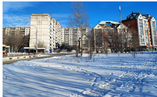
View of the microrayon from the South, by E. Gladkova, 2021