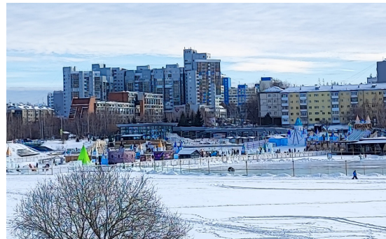
View of the microrayon from the dam, by E. Gladkova, 2023