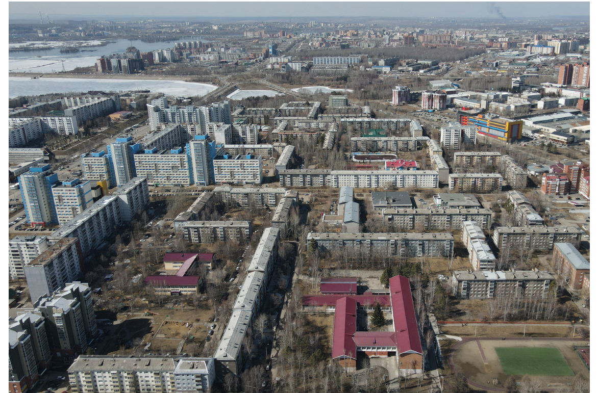
Aerial view of the microrayon from the Southeast, by R. Maliovich, 2020