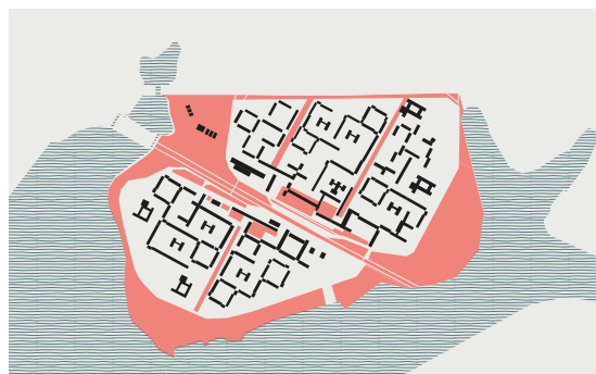
Initial Project, 1969