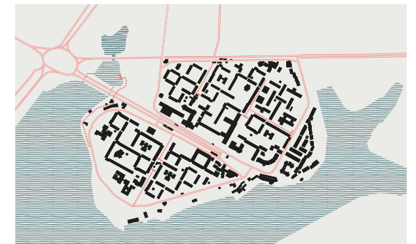
Development after 1991, 2022