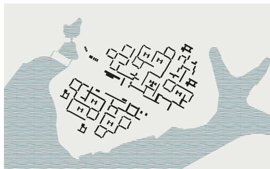
Initial Project, 1969