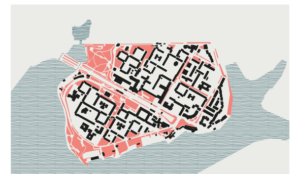
Development after 1991, 2022