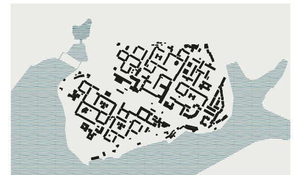
Development after 1991, 2022