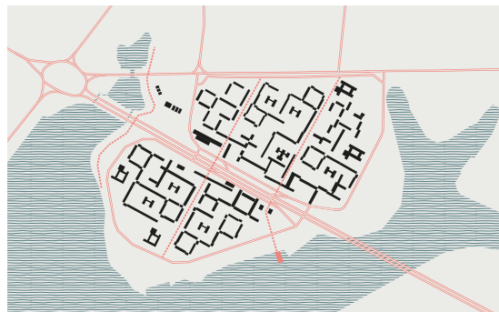
Initial Project, 1969